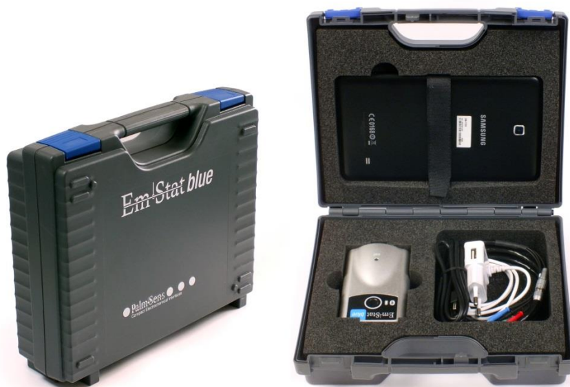
EmStat3 Blue in standard carrying case showing optional tablet